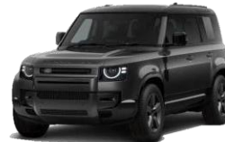
Range Rover SUV €200/way