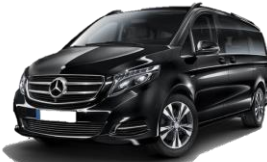
V-class €120/way (€200 round trip)