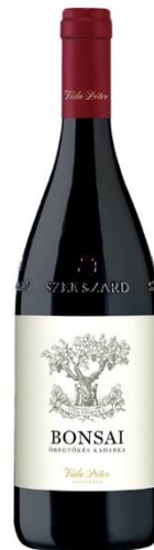
Vida Péter “PETIT BONSAI” KADARKA 0,75 L, 2023 Szekszárd 13 892 HUF / €35