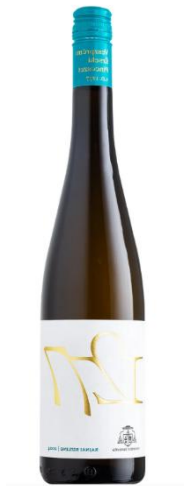
Veszéprémi Érsekségi Pincészet 1277 RAJNAI RIZLING 0,75 L, 2023 Balatonfelvidék 18 490 HUF / €47