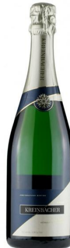
Kreinbacher BRUT CLASSIC 0,75 L, NV 19 490 HUF / €50