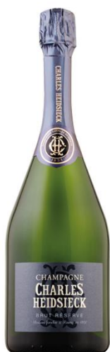
Charles Heidsieck BRUT RÉSERVE 0,75 L, NV 43 990 HUF / €572