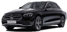
E-class €90/way (€160 round trip)