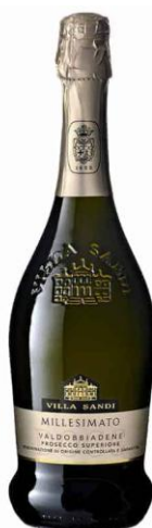
Charles Heidsieck CUVÉE “CHAMPAGNE CHARLIE” 0,75 L, NV 264 990 HUF / €572