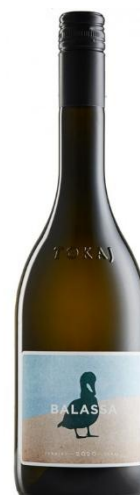
Balassa “KACSA” FURMINT 0,75 L, 2020 Tokaj 12 490 HUF / €32