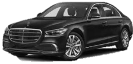
S-class €150/way (€220 round trip)