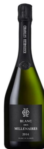
Charles Heidsieck BLANC DES MILLÉNAIRES 0,75 L, 2014 124 990 HUF / €317