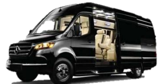
Sprinter 7+ People (upon request)

Kimpton BEM Budapest, we understand that every moment counts, which is why our private hotel car service is designed to elevate your experience at every turn. Whether you're arriving in style, exploring the city's hidden gems, or simply enjoying a leisurely drive along the Danube, let us be your trusted companion as you embark on a journey of luxury, comfort, and unparalleled sophistication.